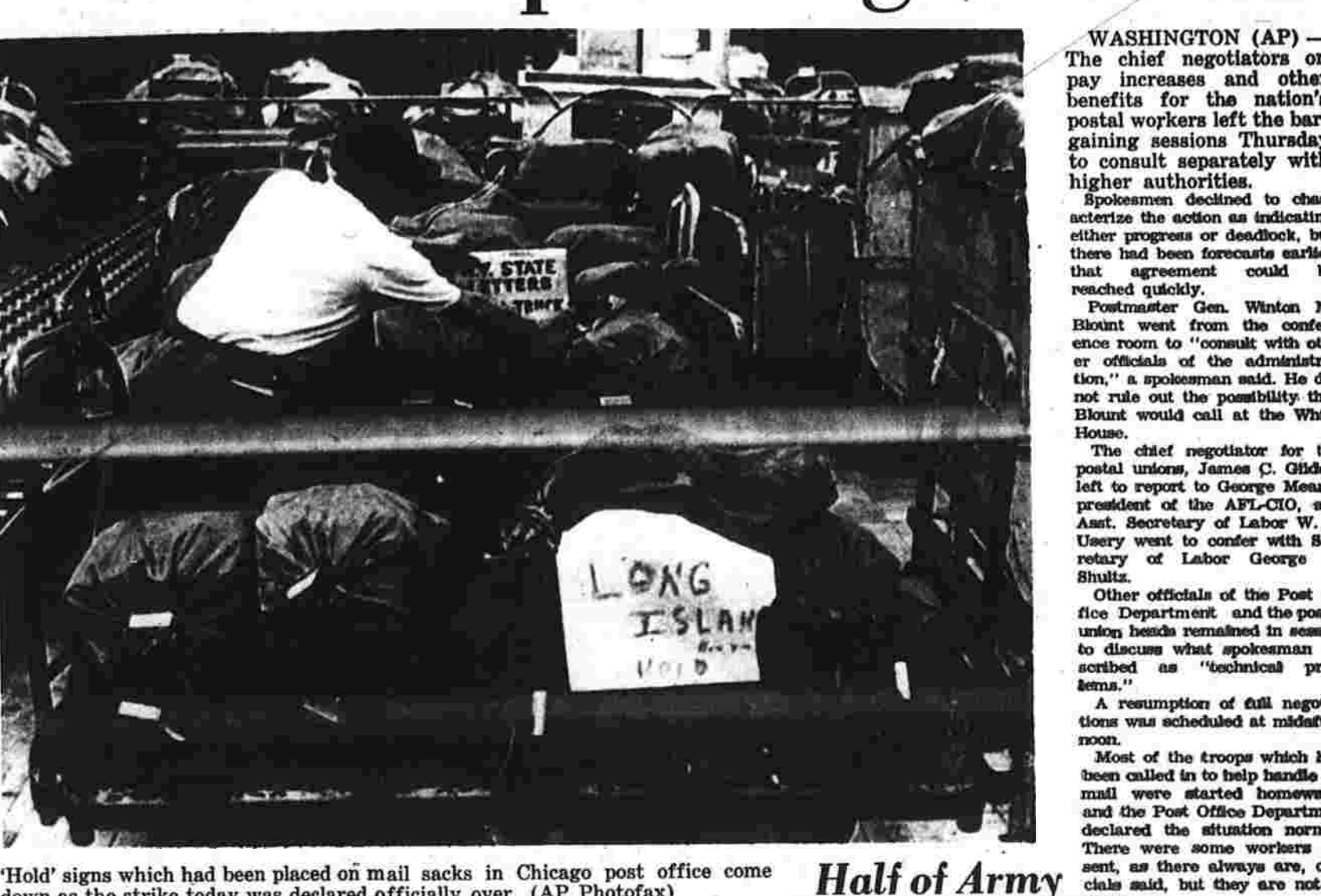
'Hold' signs which had been placed on mail sacks in Chicago post office come down as the strike today was declared officially over.