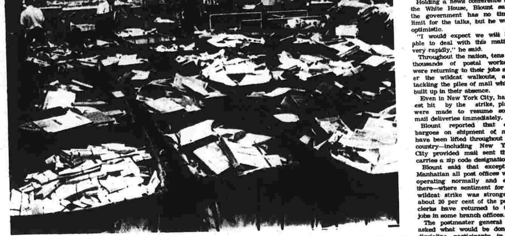
Third class and bulk mail which had piled up in Terminal Annex post office in downtown Los Angeles during the strike was among many such mountains of mail which began melting away today as workers returned.

WASHINGTON (AP)—Declaring that the postal system is "approaching normal," Postmaster General Winton M. Blount said today government and union negotiators are ready to proceed with the negotiations as scheduled in the afternoon.