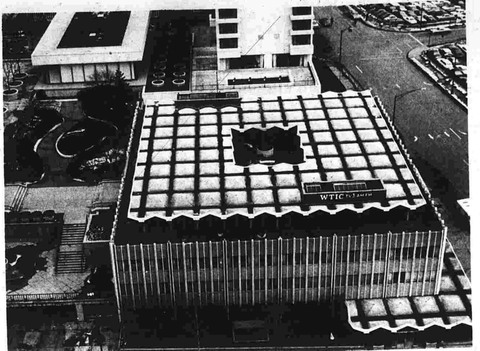
HOME OF THE ATWOOD AND STEELE