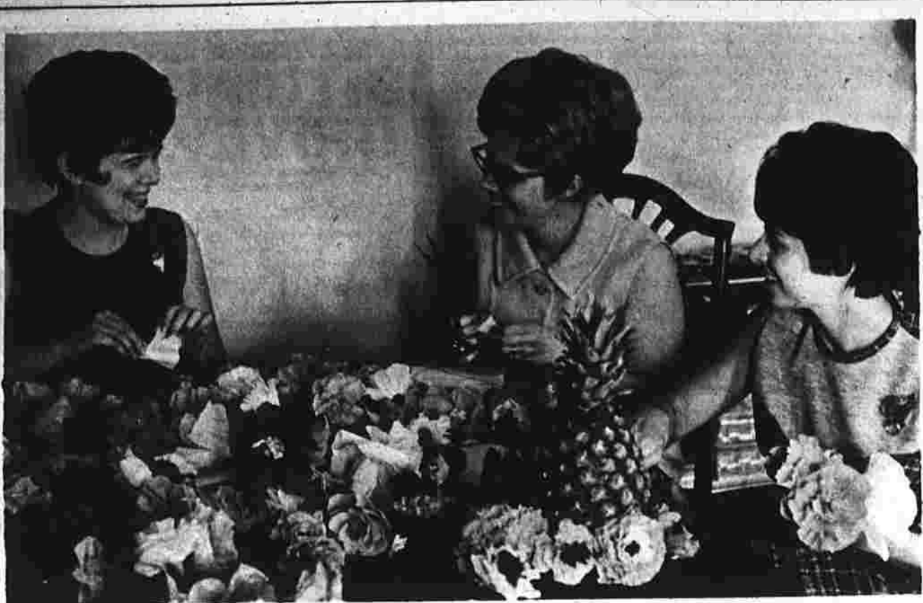
Decorations for a Dinner-Dance

Members of the Ladies of St. James make Hawaiian decorations for the semi-formal dinner-dance to be held Saturday, April 4, in the Gold Room of Willie's Steak House.