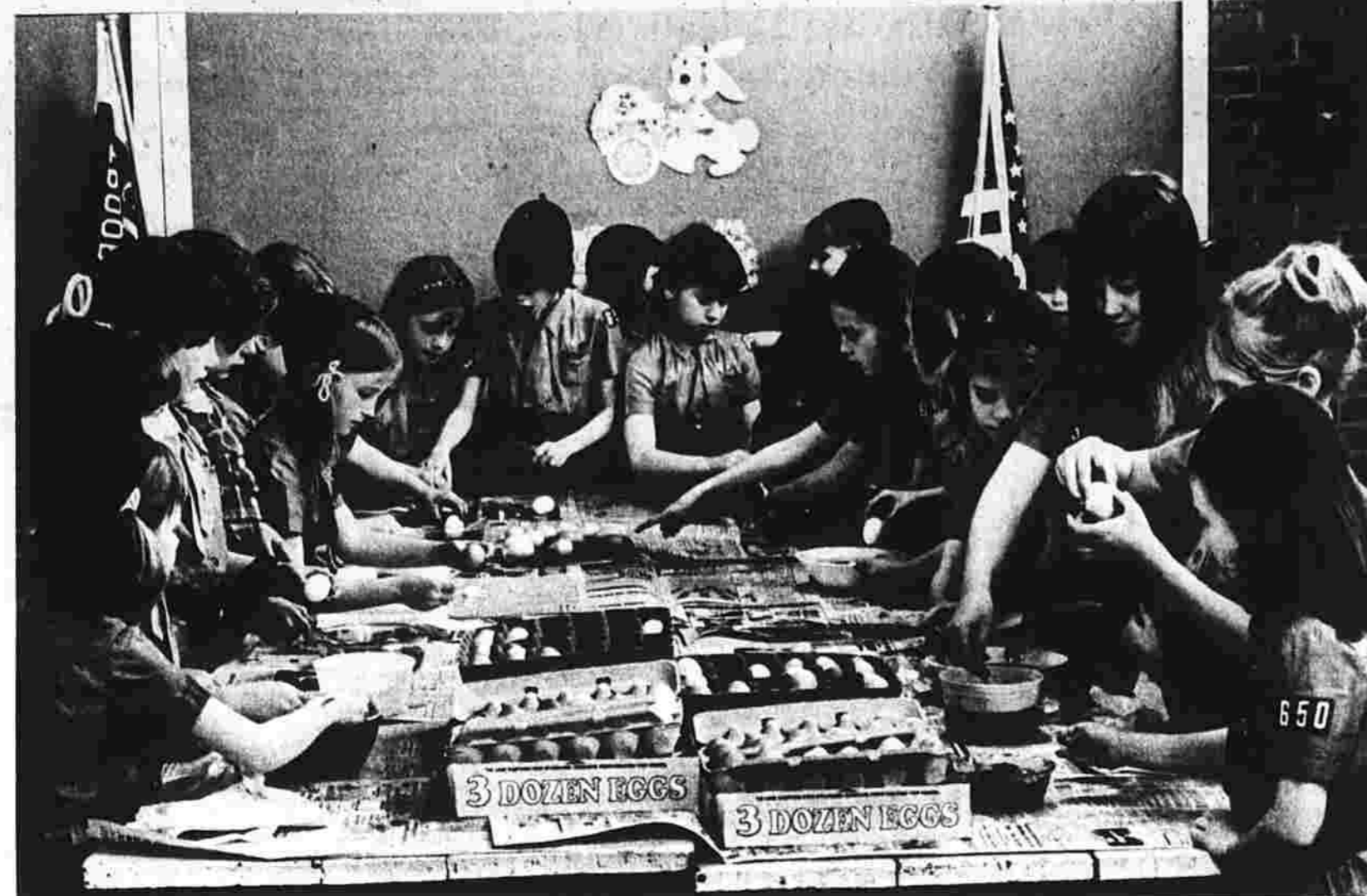
Dozens and Dozens of Eggs for Hunting

Members of Brownie Troop 650 of Bowers School dyed 10 dozen hard-boiled eggs yesterday afternoon for the Easter Egg Hunt on Saturday starting at 10 a.m. at Center Springs Park. The event is sponsored annually by the Manchester Jaycees and the PTA Council. After dying the eggs, the Brownies participated in an egg hunt given by Cadette Troop 622 of Verplanck School.